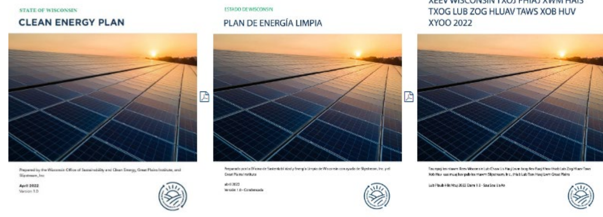
Full report at OSCE.wi.gov